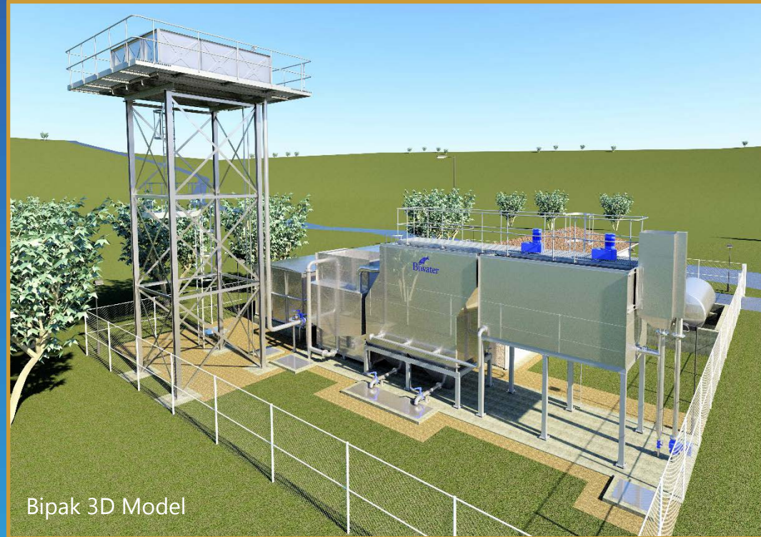
Bipak 3D Model