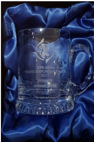
Caption: GTR-BExA Young Exporter Award presented to Alastair White