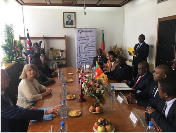
Caption: Harriett Baldwin MP, Minister of State for Africa pictured at a meeting at Camwater