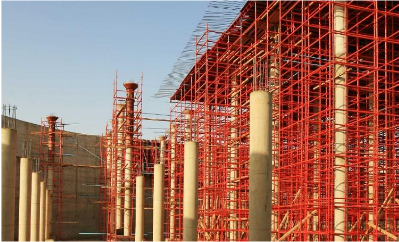
Caption: Roof construction on a 20,000 m 3 storage tank in Sudan