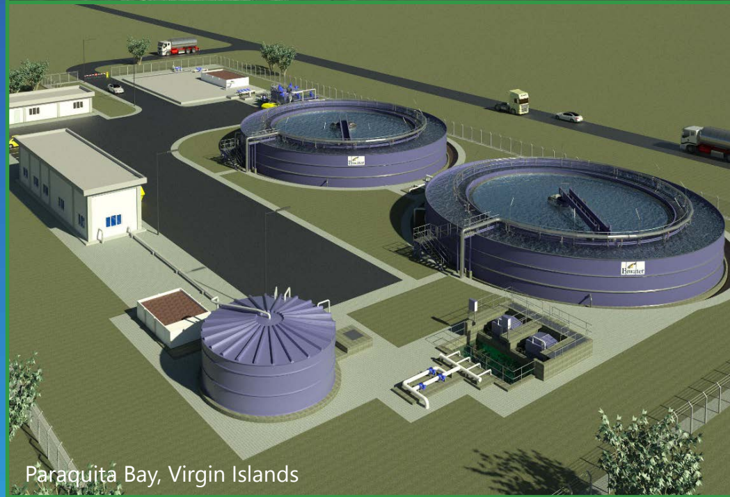
Paraguita Bay, Virgin Islands